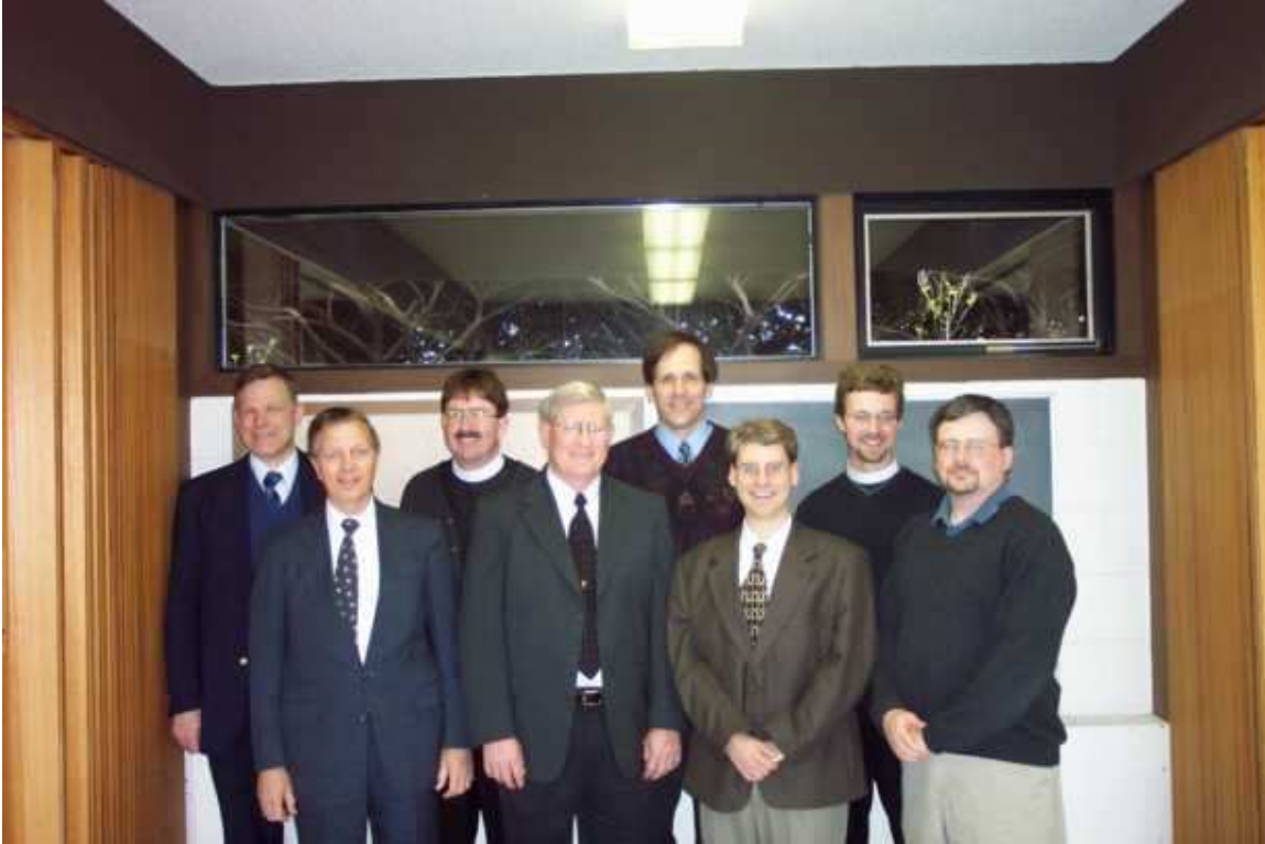
May 5 th Circuit #7 Pastors' Winkel at Pilgrim Lutheran Church in Waterloo, Iowa.