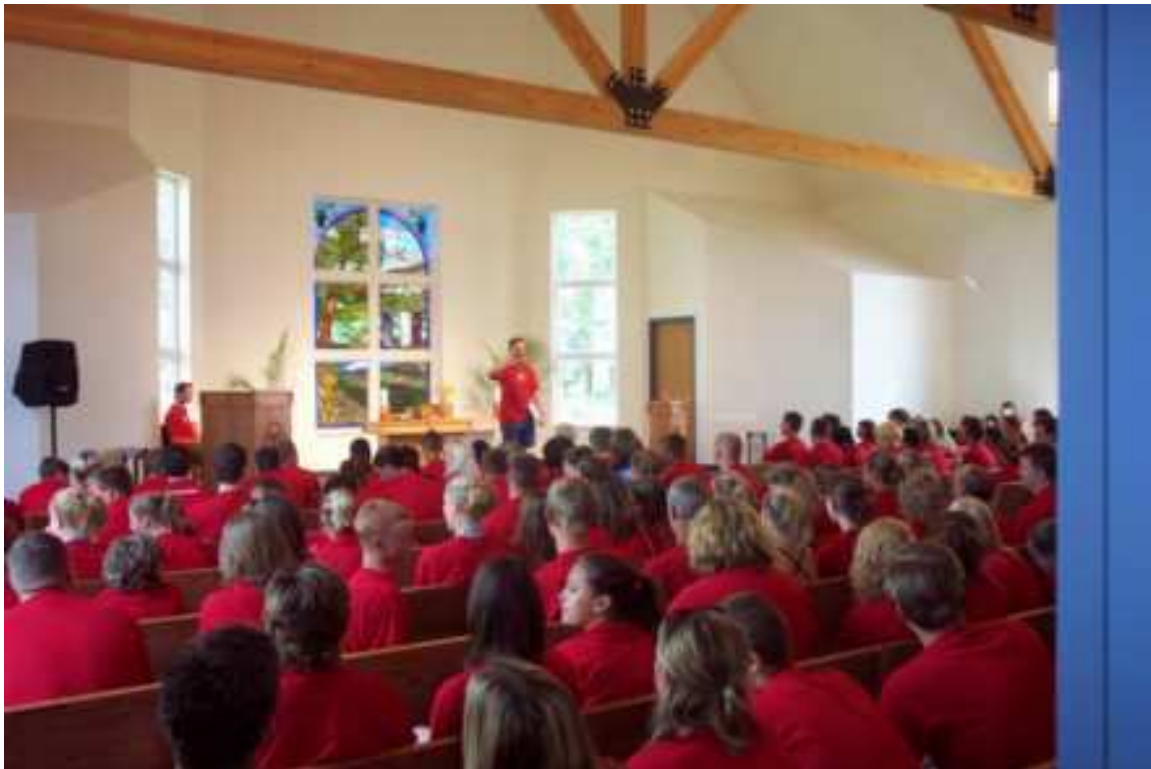
LYA at Peace Lutheran in North Mankato, MN