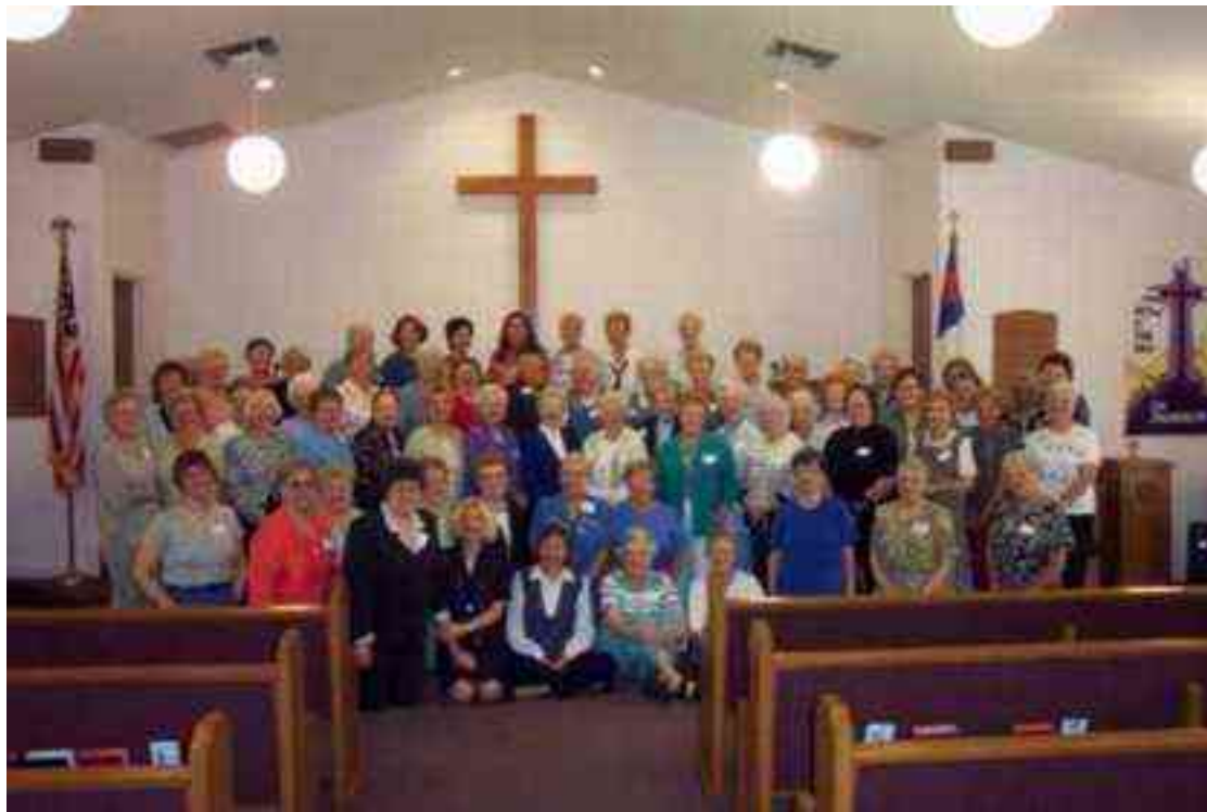
ELS FL Women's Mission Rally – March 20, 2004